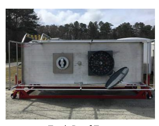
Tank Roof Top