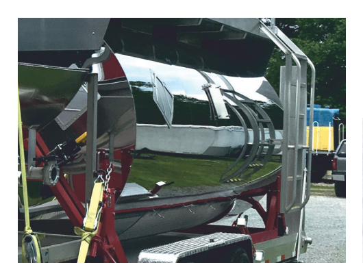
Cold Tap Patch Prop