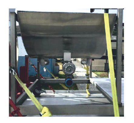
Tanker Truck Belly