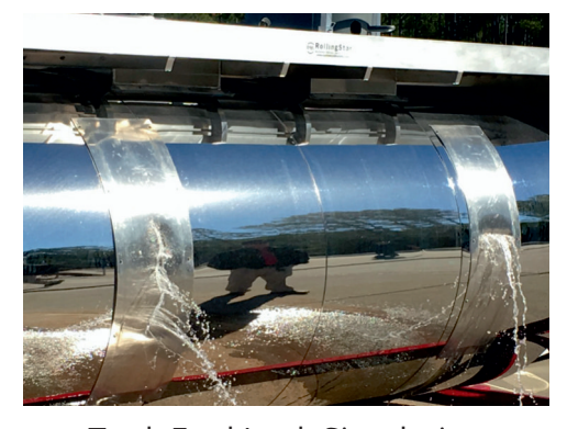
Tank Fuel Leak Simulation