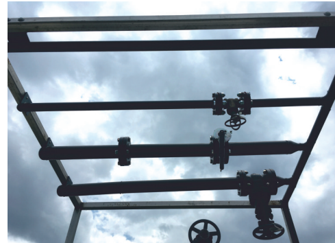
Overhead Pipe Leaks