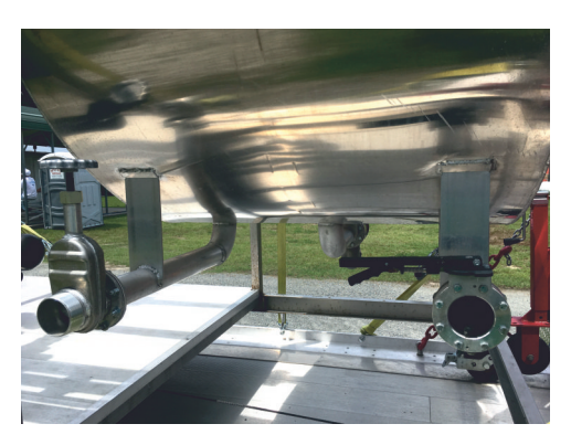
Tanker Truck Unloading Pipe Leaks