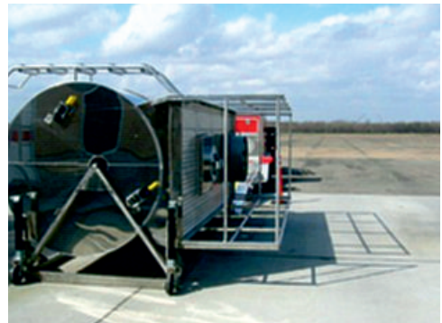
90° Roll Simulation