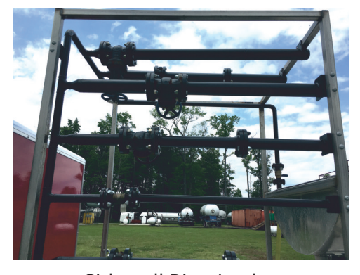
Sidewall Pipe Leaks