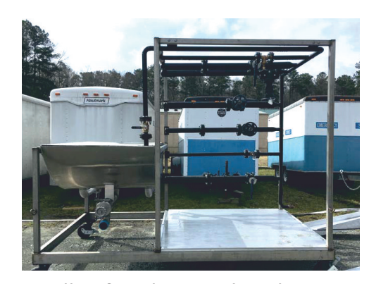
Belly of Tanker Truck with Pipes